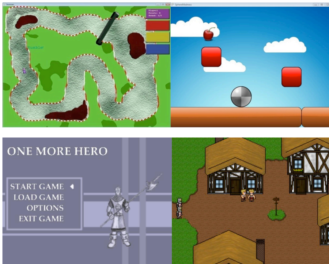
Figure 3. Game based on XNA framework (Top left: Racing; Top right: Codename Gordon; Bottom: RPG)

Figure 3 shows screenshots from four student game projects. The game at upper left corner is a racing game, the game at the upper right corner is a platform game, and the two games below are role-playing games (RPGs). Some of the XNA games developed were original and interesting. Most games were entertaining, but were lacking contents and more than one level due to time constraints.