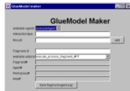
Figure 5. GUI tool for adding fragment-agent pairs to the GlueModel

pairs. A screenshot of the GlueModel Maker is shown in figure 5.