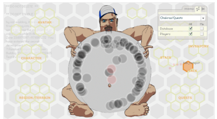
Figure 4. Database Transaction Visualizer

computer games and the Web as a delivery platform for episodic content. The game communicate to the player through several channels like comic books, Blogs, Webhacks, Web quests, 3D-client, mobile client, Applet client, and a database transaction visualizer (see Figure 4). The game has built in location-awareness and all the parts of the game are put together through the story about a character named Guy. The game does not ask the player to solve one particular problem or task, but integrate the player in the story through various user interfaces. The game also utilizes interaction over the phone by using text-to-speech and speech-to-text software. The various software components in the game are based mainly on open source software integrated through a database. The unexceptional.net game shows how it is possible to produce pervasive game that includes fine art and pop culture with a multitude of game-play elements and ways of interacting with the players.